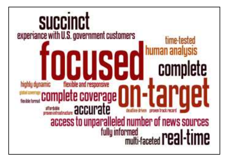
Our comprehensive METRIC<sup>T</sup> solution brings calm and focus to the news that is most important to you.

Is your current news solution giving you a clouded view of the news that is important and most relevant to your organization?